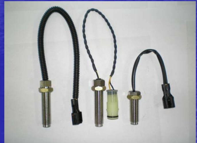
RPM Sensor- Speed 1