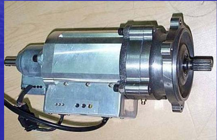
EPS SYSTEM –BLDC