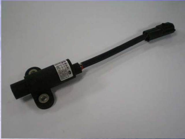
RPM Sensor – Speed 2