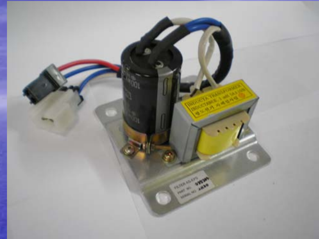
EPS- Filter Ass'y