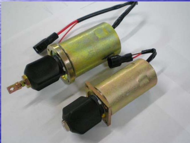
SOLENOID- Engine Stop