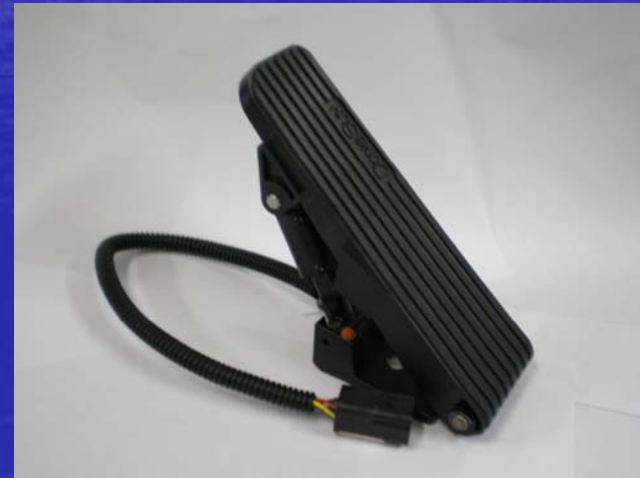
Electric Pedal 2