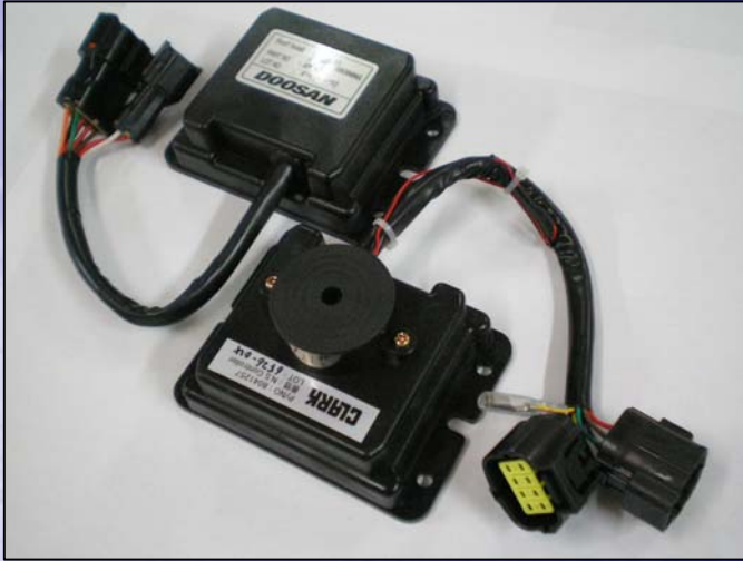
Safety Relay warning