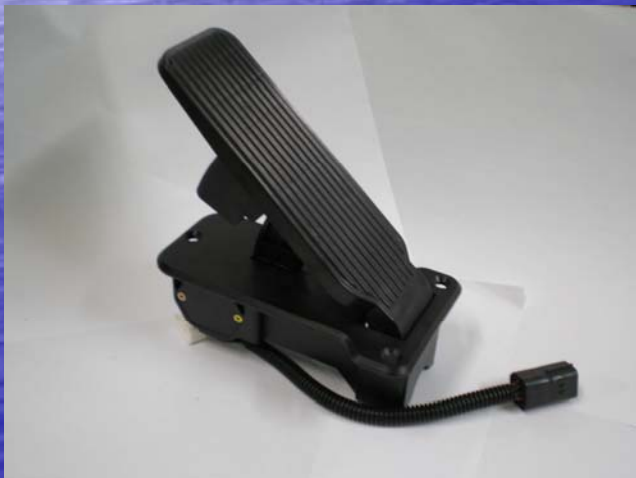
Electric Pedal 1