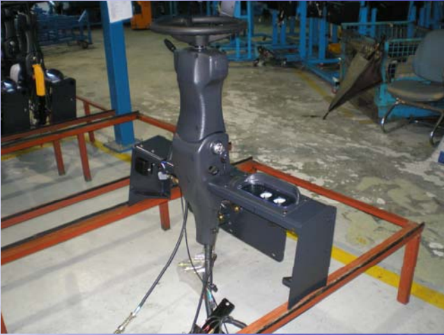
Front Cockpit Unit