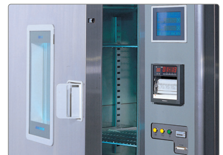
Door Catch & Trim